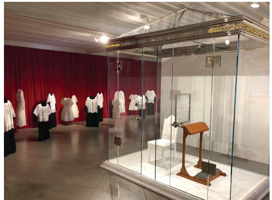
BLESS ME CHILD FOR I HAVE SINNED and THE CHILDREN

In the Renzo Piano Pavilion at Château La Coste, Provence, France – December 2019