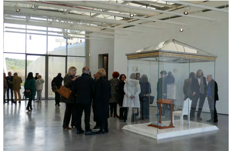
BLESS ME CHILD FOR I HAVE SINNED

In the Renzo Piano Pavilion at Château La Coste, Provence, France – December 2019