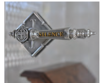
1) BLESS ME CHILD FOR I HAVE SINNED, 2010 – 2013 glass, marble, wood, nails, nickel-plated composite, linen and plexiglass, 102 x 94 x 58 inches